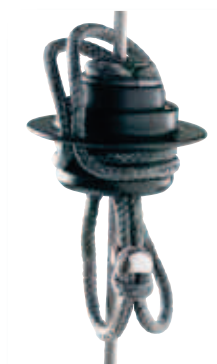
Wichard textile fastening system